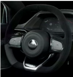
Black Leather & Stitching (Standard) Black Alcantara & Stitching (V6 manual & auto)