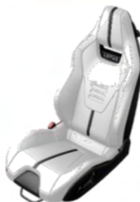
Grey Nappa Leather