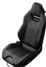
Black Nappa Leather