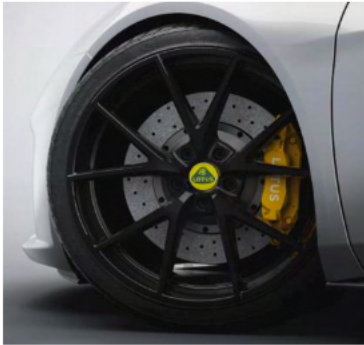
20" Ultra-Lightweight V-Spoke Forged - Gloss Black