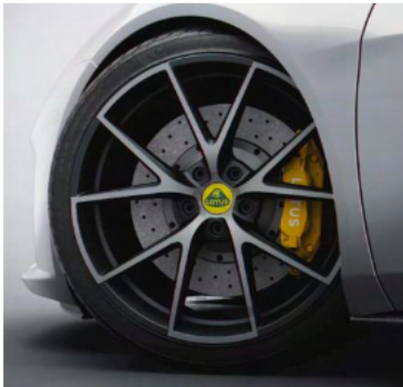
STANDARD 20" Ultra-Lightweight V-Spoke Forged - Diamond Cut