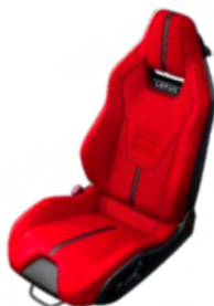
Red Nappa Leather