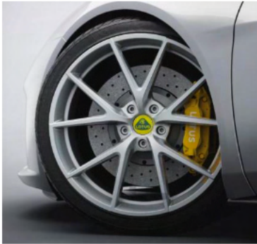
NO COST OPTIONS 20" Ultra-Lightweight V-Spoke Forged - Silver