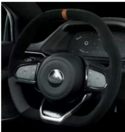
Black Leather or Alcantara, choice of: Grey TDC & Stitching Red TDC & Stitching Yellow TDC & Stitching (V6 Auto only)