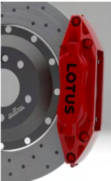
NO COST OPTIONS Red, Yellow, Silver