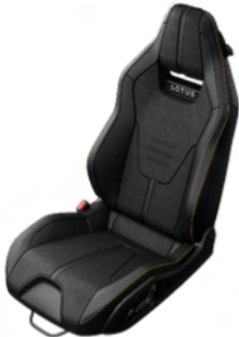
Black Alcantara, Yellow Stitch