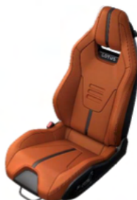
Tan Nappa Leather